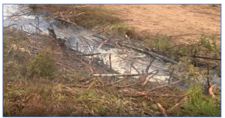
The fire did not spread from the treated area – it quickly subsided.

Watch the video on YouTube: <a href="https://www.youtube.com/watch?v=MdEOLCxxoLY">https://www.youtube.com/watch?v=MdEOLCxxoLY</a>.