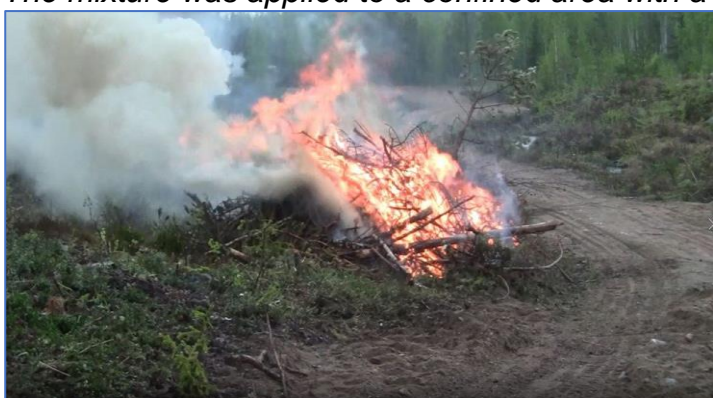
The fire was lit in a dry, giant pile of twigs.

The mixture was applied to a confined area with a hand sprayer and heavier equipment.